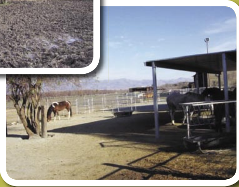
» AFTER: Exclusionary fencing and grading for proper drainage. Easier to clean and no mud!