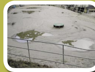
» BEFORE: Very muddy arena