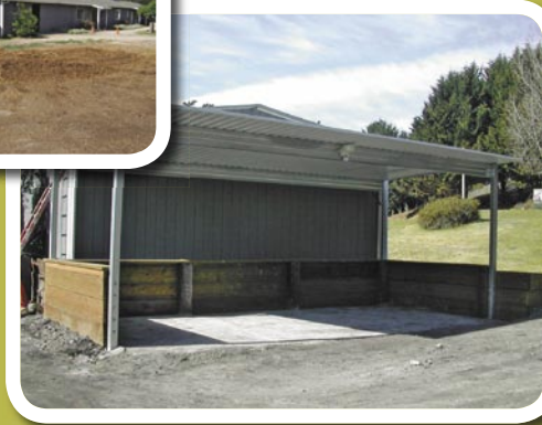
» AFTER: Covered manure bunker with concrete floor