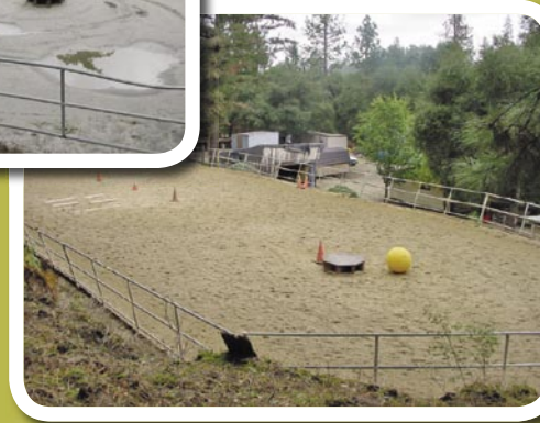
» AFTER: Proper drainage significantly reduced pooling and sediment runoff

The Livestock and Land Program is a partnership between the local Resource Conservation Districts, Natural Resources Conservation Service (NRCS) and non-profit Ecology Action.